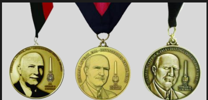
AIA NJ LITWACK AWARD (Sketch, Fabrication, Medal)