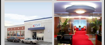
POLISH SLAVIC & NJ DEVILS (Top: Render | Bottom: As-built)