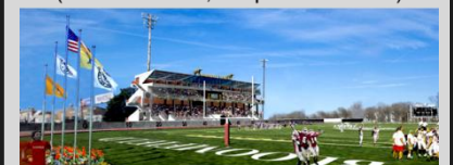
BLOOMFIELD FOLEY FIELD